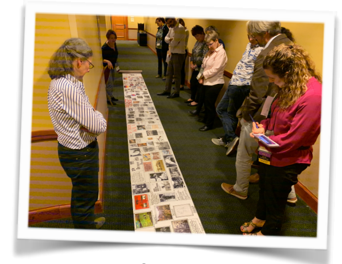
"Die Lisa": A Student-Made Timeline